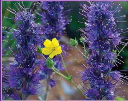
Purple Fringe & Yellow Flower