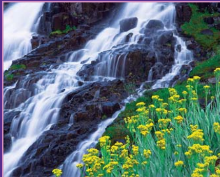
Wildflowers by Waterfall